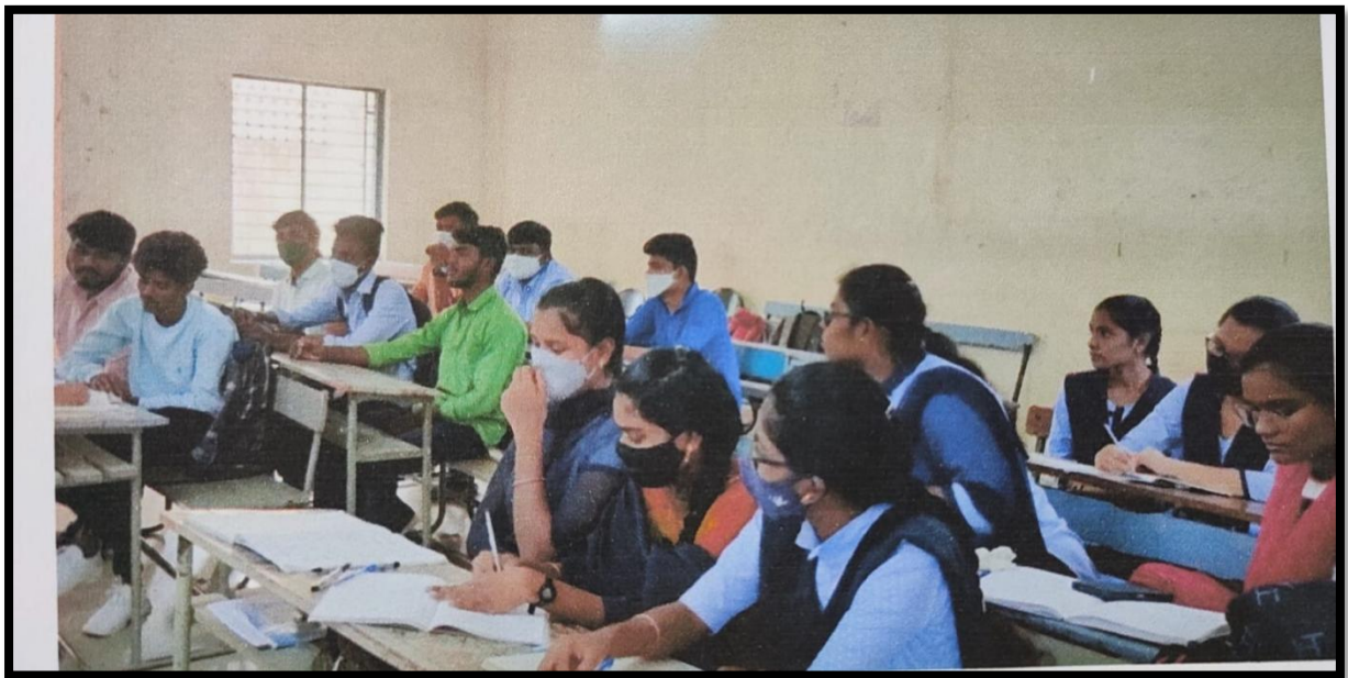
Orientation class on Data Analyst