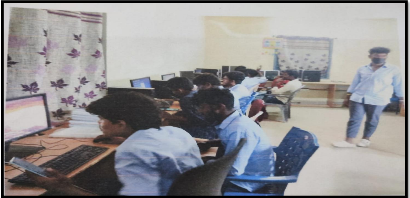
Lab work done by the students